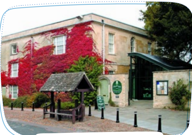
Oxfordshire Museum Woodstock

The council supports the collection, preservation and care of Oxfordshire’s heritage directly through four cultural venues: the Oxfordshire Museum in Woodstock, the Oxfordshire History Centre in Cowley, the Museums Resource Centre in Standlake (housing the reserve collection and outreach service) and Swalcliffe Barn near Banbury. The History Centre is the designated Diocesan Record Office for Oxfordshire, which preserves and makes available records of parishes, the Oxford Archdeaconry and Oxford Diocese.