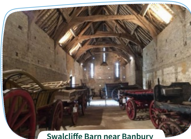
Swalcliffe Barn near Banbury

Through an extensive programme of workshops in schools and at the museum, programmes of informal creative activities for families, and through collection loans to schools, the Museums Service enables children to experience the inspirational power of learning from the ‘real thing’.